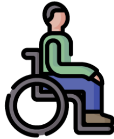
Persons with disabilities

Strengthen indigenous peoples' rights to informed consent and participation