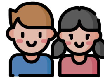
Children and youth

Explore legal reform of gender-change registration requirements