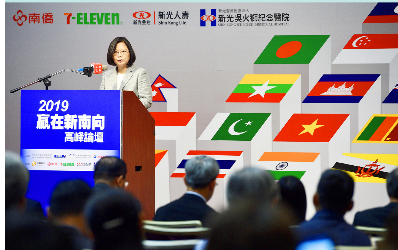
▲ President Tsai Ing-wen (蔡英文) speaks at a forum on the New Southbound Policy on May 30, 2019.

*BETWEEN TAIWAN AND ITS 18 PARTNER COUNTRIES