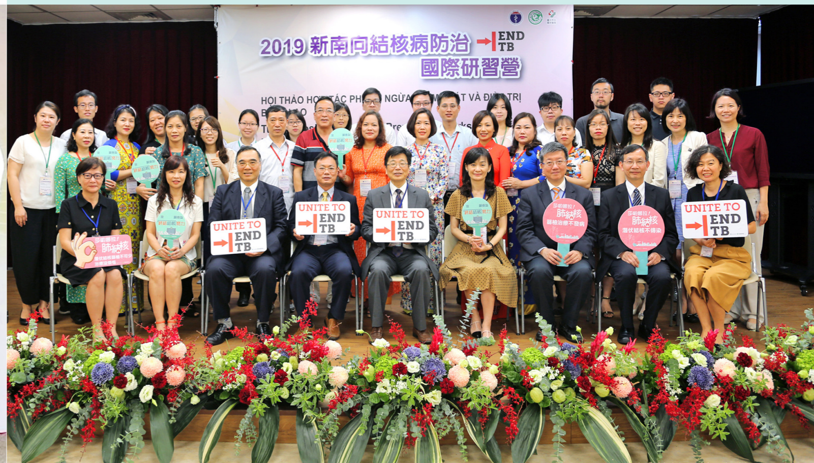
▲ The Centers for Disease Control hosts a tuberculosis prevention workshop with health professionals from Vietnam.