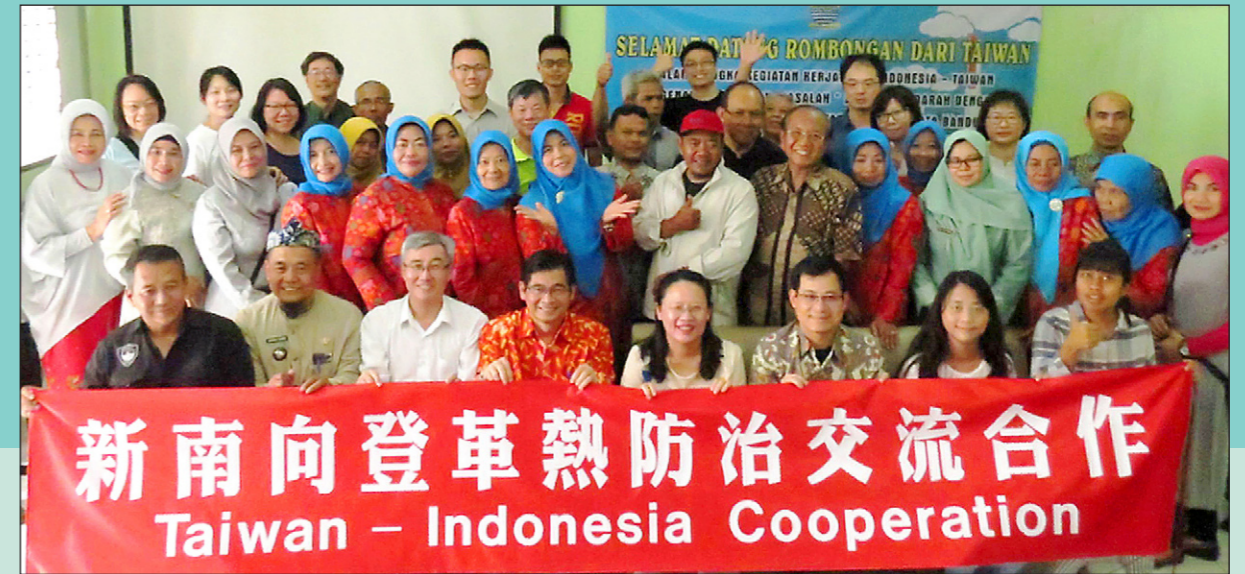
▲ The Centers for Disease Control presented a week-long dengue fever prevention workshop for Indonesian health professionals.

In 2018, the CDC initiated the New Southbound Dengue Prevention and Control Collabo-