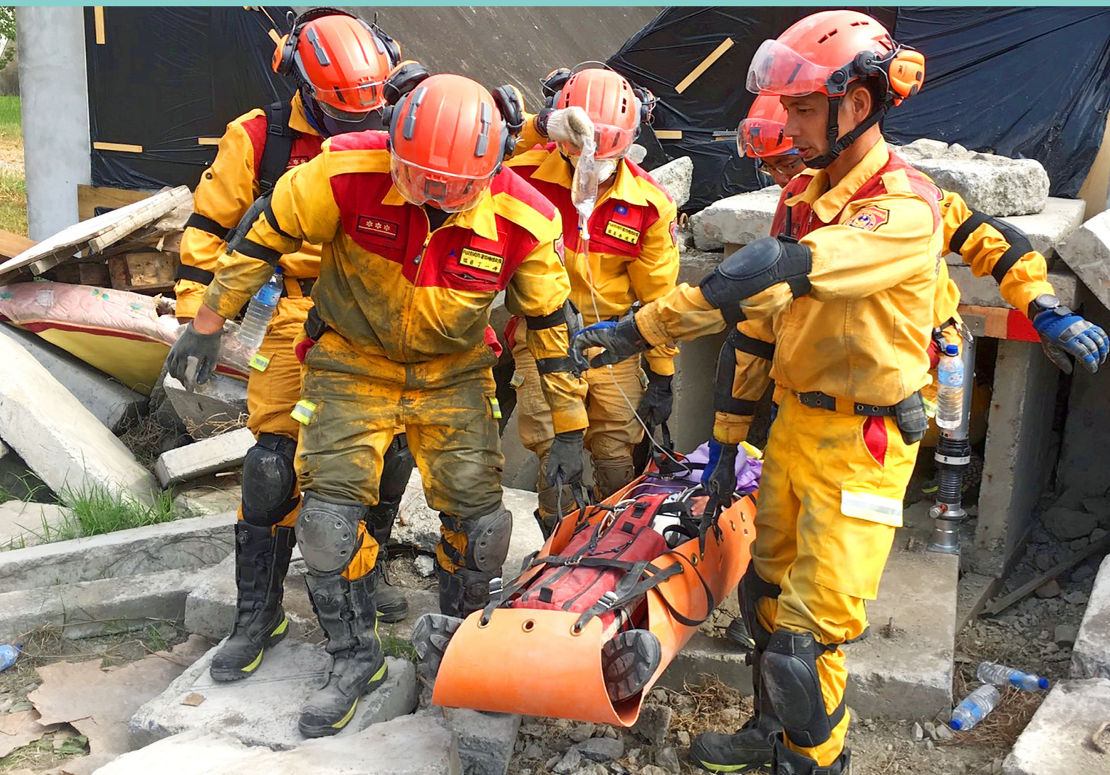
▲ The National Fire Agency organizes a search and rescue drill at its training center in Nantou County.