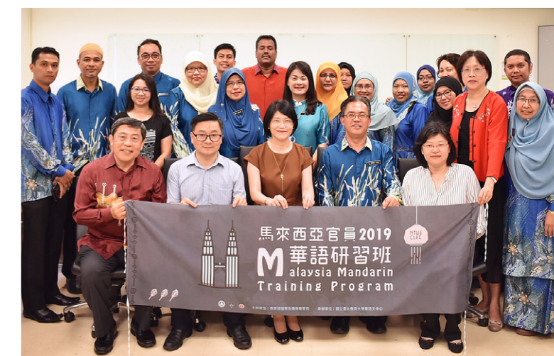
▲ Malaysian education officials participate in the week-long Malaysia Mandarin Training Program.