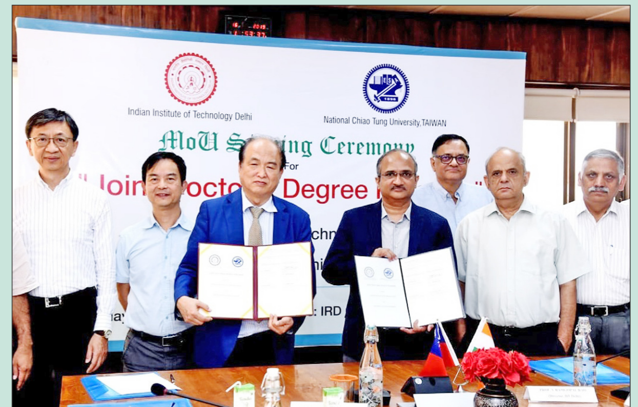
▲ National Chiao Tung University (交通大學) established a joint doctoral program with the Indian Institute of Technology (IIT) Delhi in May 2019.

Students focusing on semiconductors and optoelectronics receive preference. The goal is to have 200 students enrol in the next two years, and so far 25 Indian students have signed up. To help with recruitment and better prepare the students for Taiwan, Ministry of Education-sponsored Mandarin-language teachers have been sent to two IIT campuses to offer lessons and gain a deeper understanding of local needs.