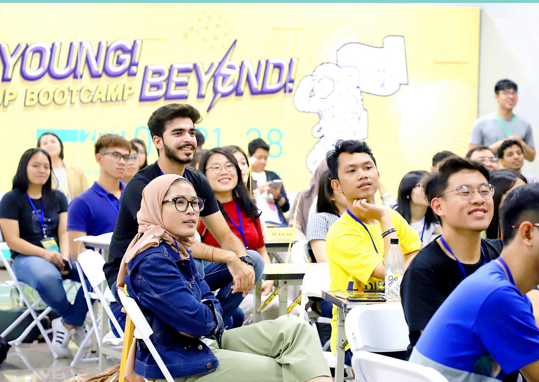
▲ ABOVE: Students from New Southbound Policy partner nations and their Taiwanese counterparts participate in a National Taiwan University of Science and Technology week-long boot camp in Taipei on July 23. RIGHT: Nearly 200 talents were matched at a New Southbound Markets Recruitment event on June 4, 2019, in Taipei.

THE Taiwan External Trade Development Council launched three New Southbound Market Recruitment Matching events in Taipei, Kaohsiung and Taichung in 2019, where 105 Taiwanese companies offered 1,300 jobs in diverse fields including finance, precision industry, aquaculture and communications.