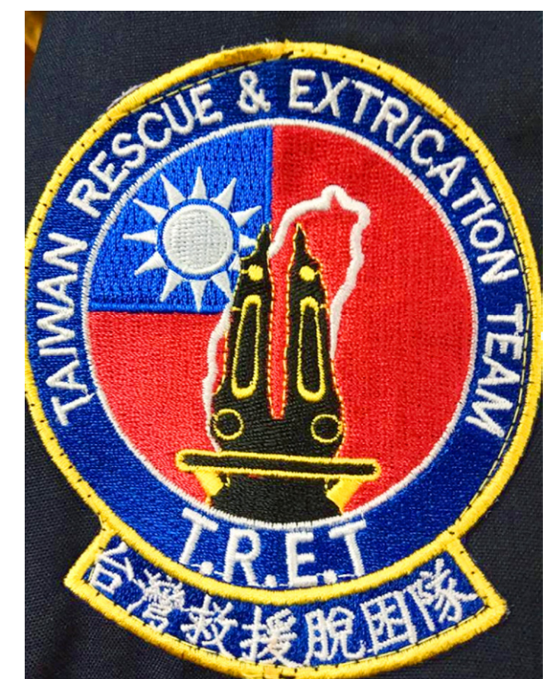
▲ A Taiwan Rescue and Extrication Team badge.

AS South and Southeast Asia are prone to various disasters, including earthquakes and flooding, the National Fire Agency has been providing increased training in disaster prevention and relief through the New Southbound Policy, with the goal of reinforcing the region’s mutual aid network.