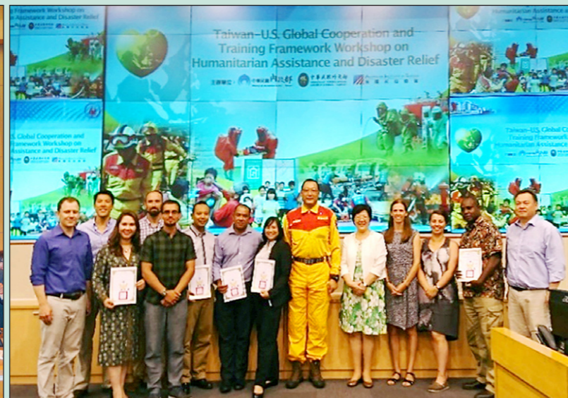
▲ LEFT: Representatives of the New Taipei City Fire Department and their counterparts from two Philippine cities pose for photographs after signing a memorandum of understanding on March 14, 2019. RIGHT: The Taiwan-US Global Cooperation and Training Framework hosts a humanitarian assistance and disaster relief workshop.

In collaboration with the EPA's Toxic and Chemical Substances Bureau and the National Yunlin University of Science and Technology, the NFA has been offering hazardous materials first responder operations training to South and Southeast Asian countries for the past three years. The latest event, in August 2019, included 22 students from India, Indonesia, Pakistan, and Vietnam, and a workshop in November 2019 will cater to government officials, academics, and professionals from partner countries.