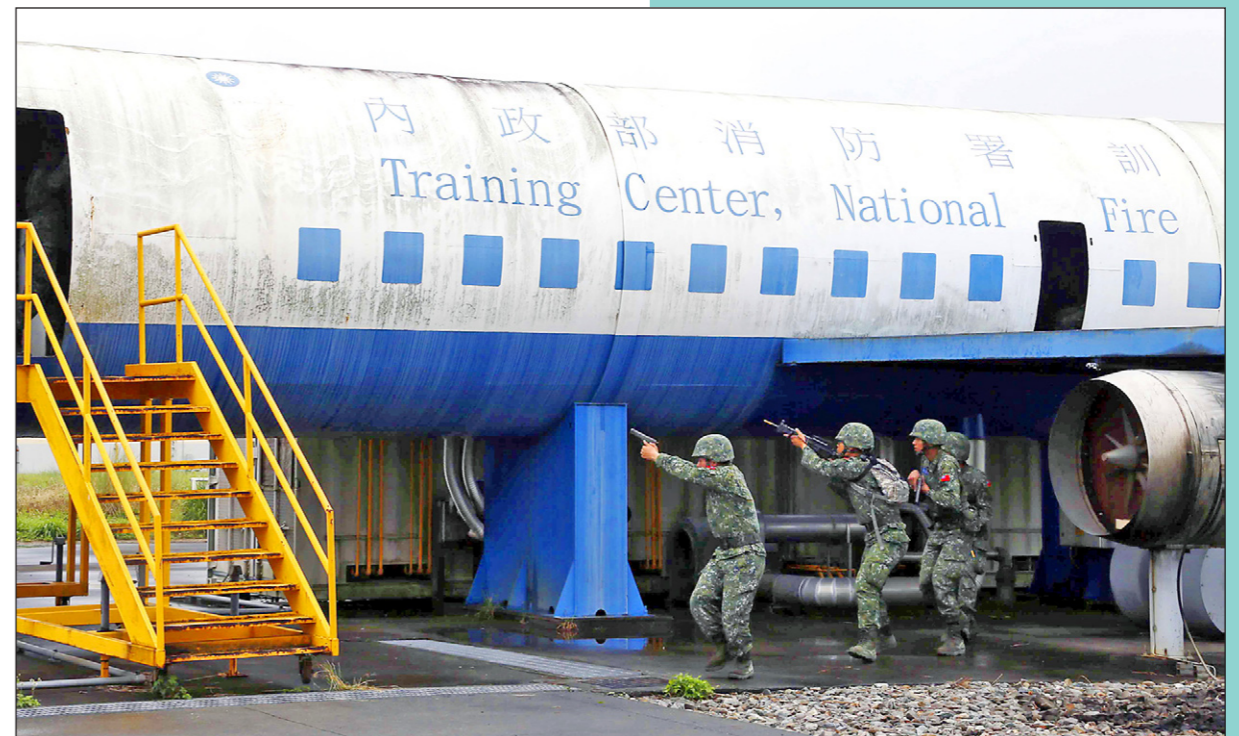
▲ Army personnel undergo aircraft disaster and hijacking training at the National Fire Agency's training center in Nantou County's Zhushan Township on Sept. 1, 2019.