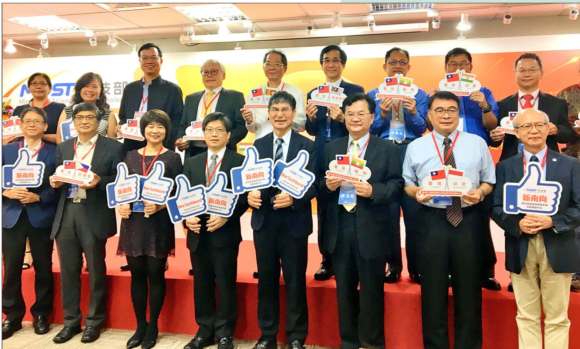
▲ Minister of Science and Technology Chen Liang-gee (陳良基), front row fifth from left, touts the achievements of 12 overseas research centers in nine countries covered by the New Southbound Policy initiative, at a news conference in Taipei in August 2019.

IN AUGUST 2019 , the Ministry of Science and Technology unveiled the achievements of its 12 overseas research centers in South and Southeast Asia, focusing on a range of fields including engineering, artificial intelligence (AI), healthcare, environmental change, as well as the humanities and social sciences.