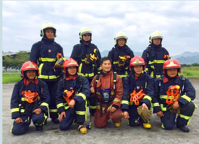
▲ Vietnamese firefighters, bottom right, undergo firefighting training at the National Fire Agency's training center in Nantou County's Zhushan Township.

In July 2018, the government announced that the training would be extended to professional Philippine firefighters based on the New Southbound Policy. Exchanges between the two nations have increased, with delegates from the Philippines' National Fire Training Institute as well as government officials visiting the facility in 2018 and 2019. The Philippine government in turn invited the National Fire Agency to share its experience with its counterparts in Manila.