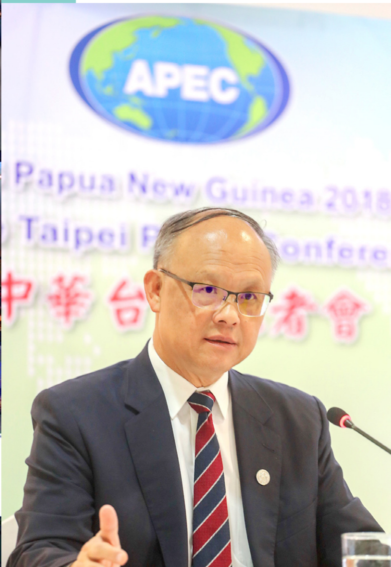
▲ Minister Without Portfolio and Office of Trade Negotiations head John Deng (鄧振中) attends the APEC ministerial meeting in Port Moresby, Papua New Guinea, on Nov. 15, 2018.

It promotes a new model of economic development for the nation that reduces reliance on a single market, Tsai said, and avoids directly competing with China's Belt and Road Initiative, which focuses on regional infrastructure; Taiwan's projects are all about people and soft power, supporting tourism, education, healthcare, technology, small and medium enterprises, and agriculture.