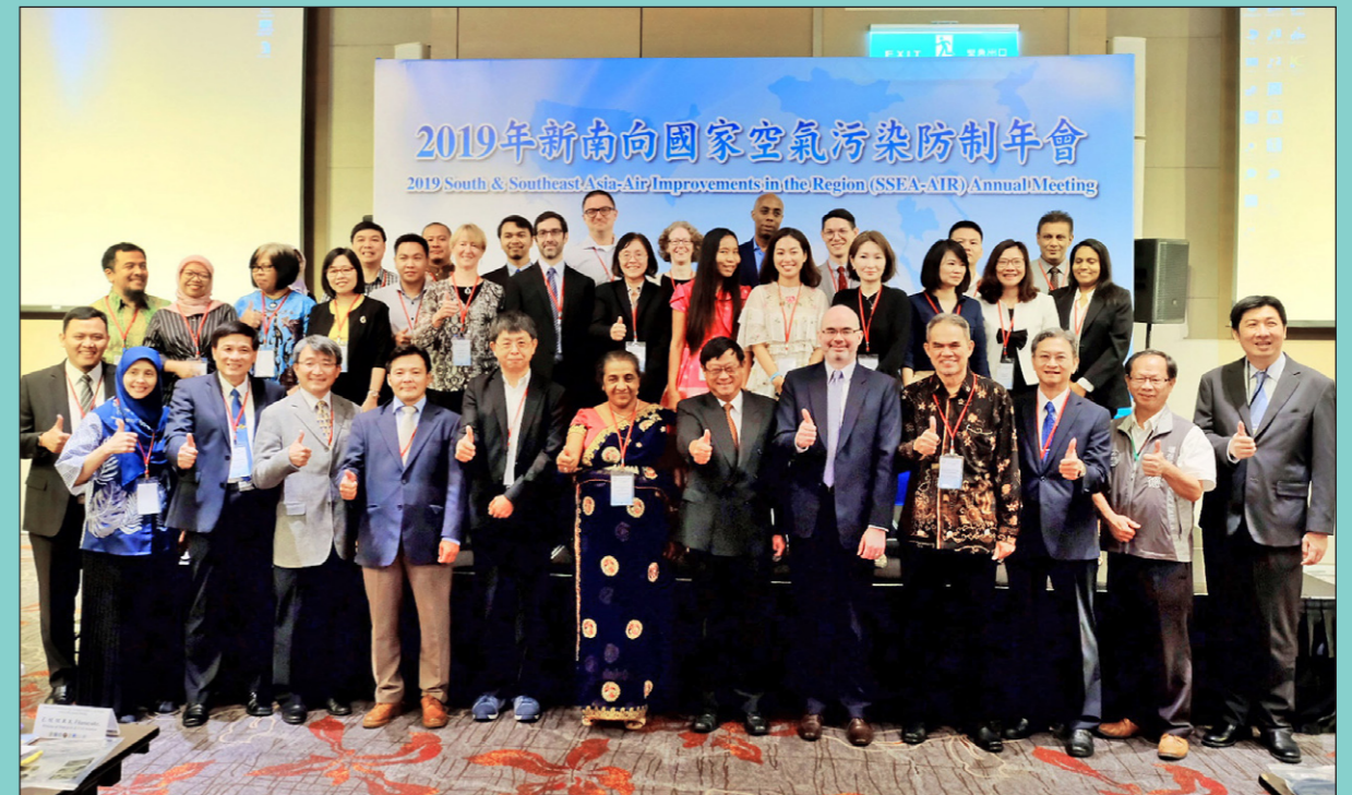
▲ Taiwan hosts an air quality improvement conference with delegates from the Indo-Pacific region.

AT the 2019 Air Quality Management Policy Development Workshop in Taiwan, the EPA handed over 100 Taiwan-made air pollution detection kits to Vietnam’s Environmental Administration. Taiwan had also provided mercury pollution testing equipment and know-how to Sri Lanka in 2018.