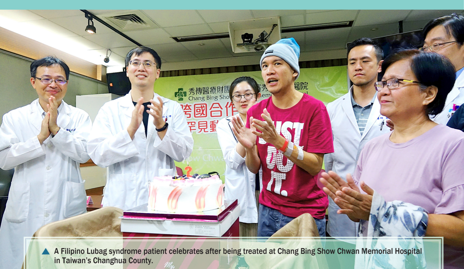
▲ A Filipino Lubag syndrome patient celebrates after being treated at Chang Bing Show Chwan Memorial Hospital in Taiwan's Changhua County.