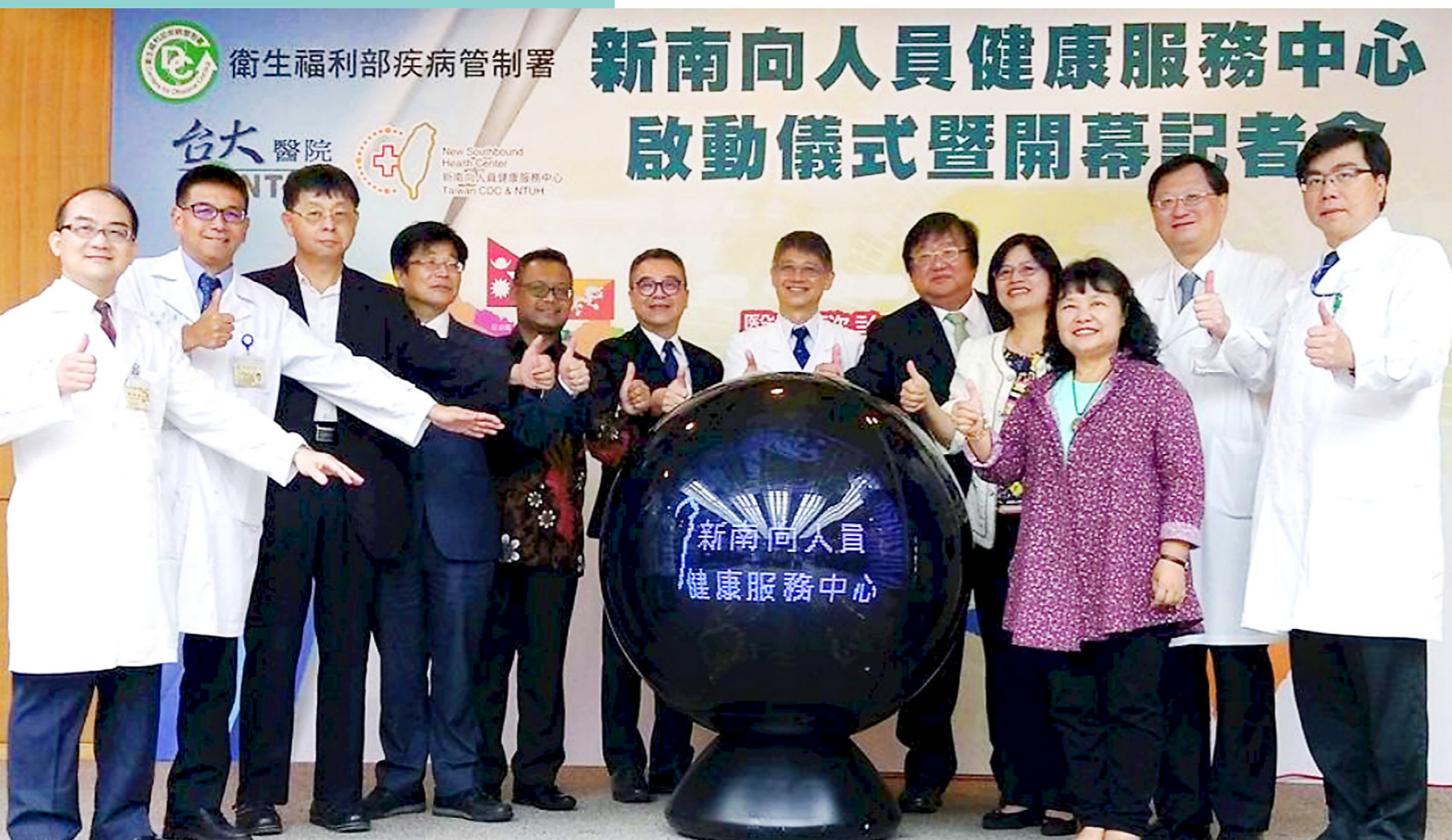
▲ National Taiwan University Hospital, commissioned by the Centers for Disease Control, established the nation's first New Southbound Personnel Health Service Center in August 2018.

The original hospitals and their six assigned nations are: ● National Taiwan University Hospital, serving Indonesia; ● National Cheng Kung University Hospital, serving India; ● Changhua Christian Hospital, serving Thailand; ● Chang Gung Memorial Hospital, serving Malaysia; ● Hualien Tzu Chi Hospital, serving the Philippines; ● and Taipei Veterans General Hospital and National Yang-Ming University, serving Vietnam.