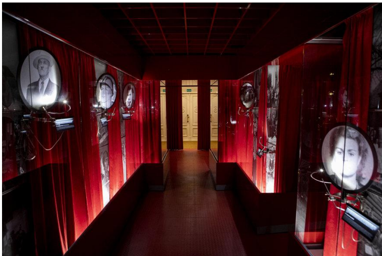
Project “ Homo Sovieticus ” exhibition at Tuskulėnai Peace Park, Vilnius