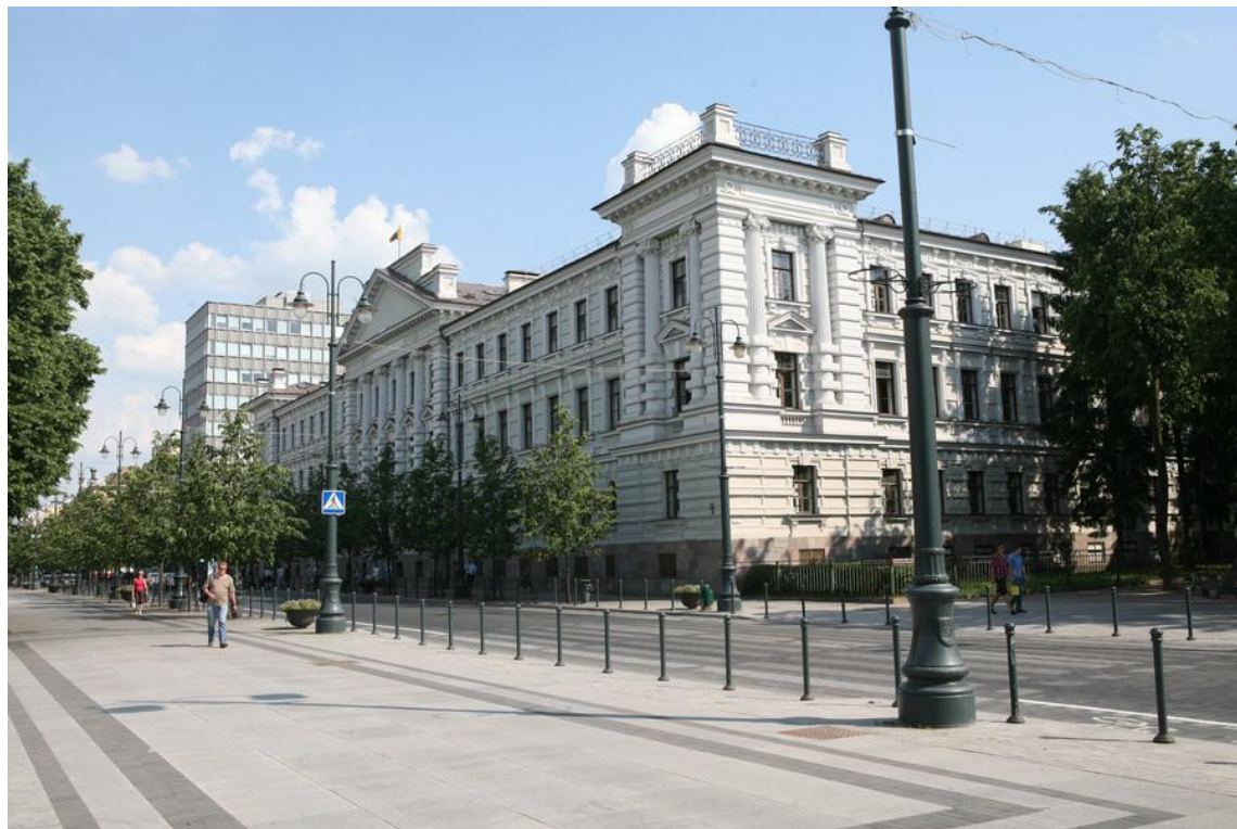
The Special Archives of Lithuania