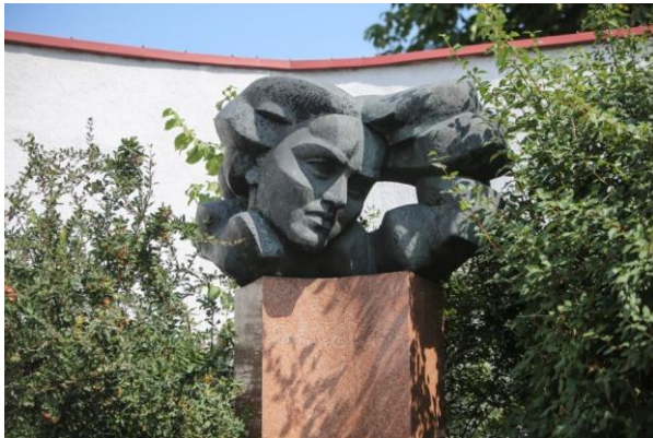
Monument to Salomėja Nėris