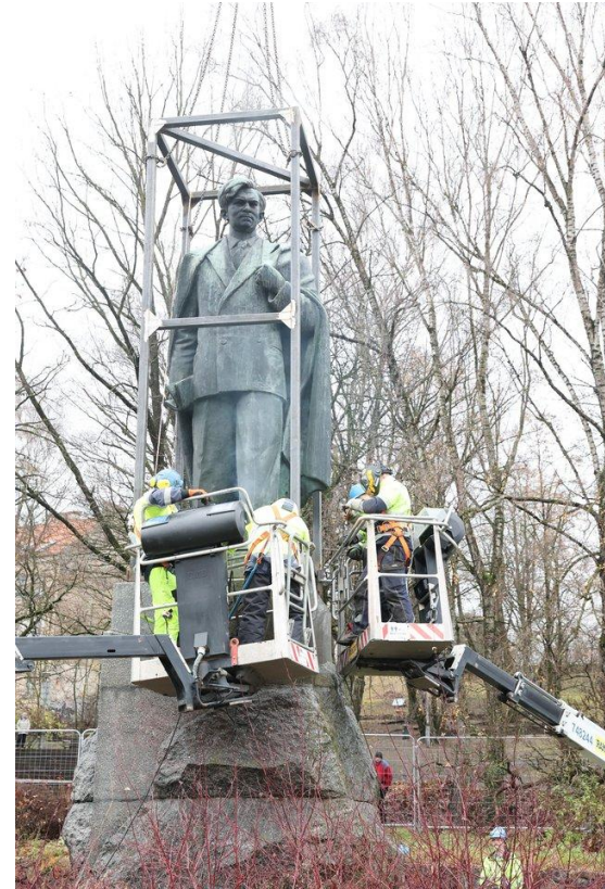
Removal of writer Petras Cvirka's Monument, Vilnius 2019