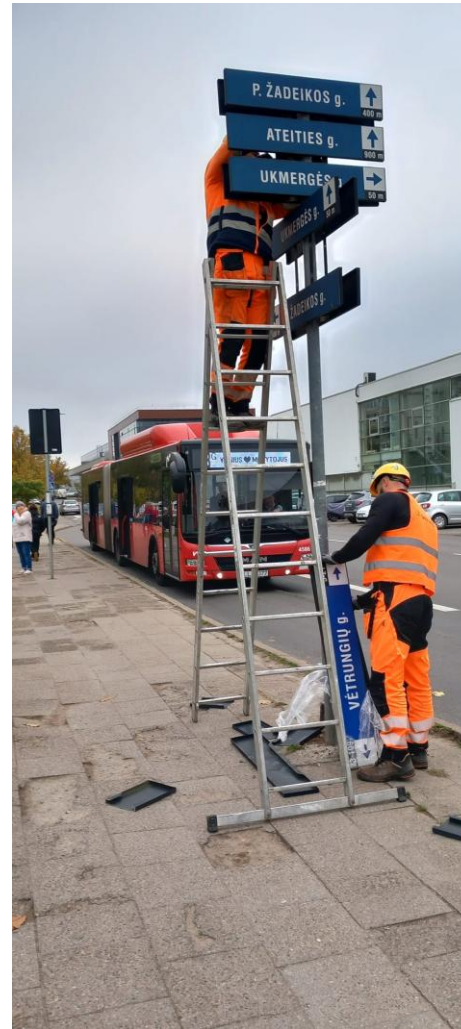
Replacement of the Salomėja Nėris Street Plaque