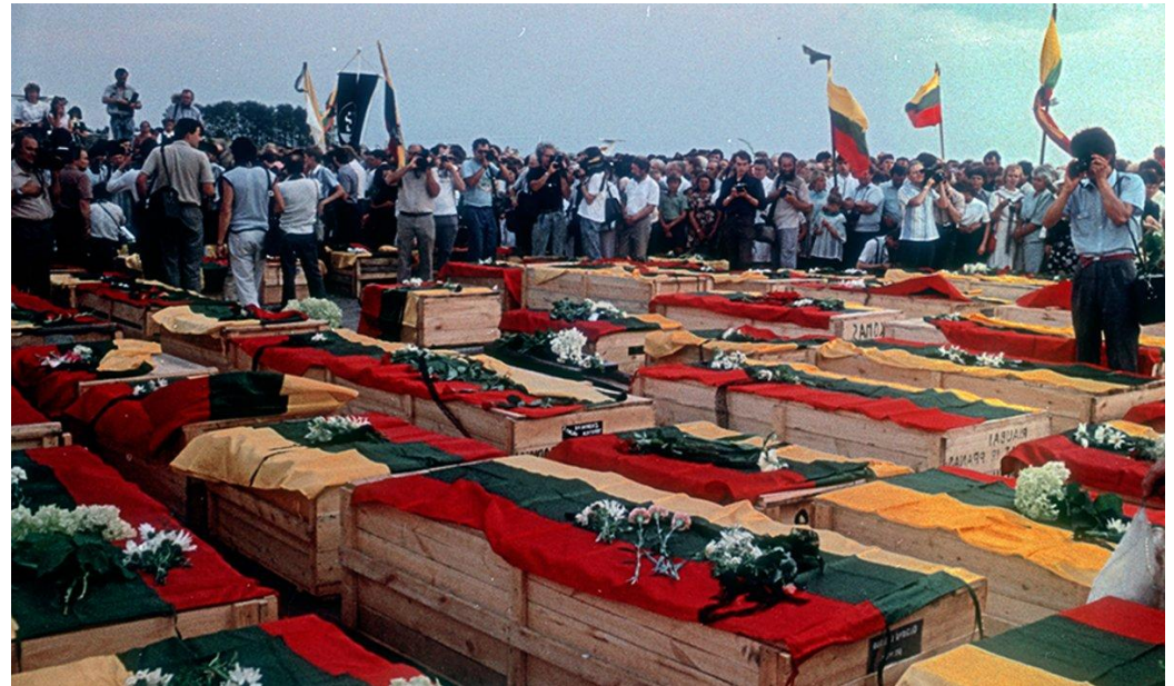
Solemn ceremony of returning deportees' remains from Siberia to Lithuania in 1989