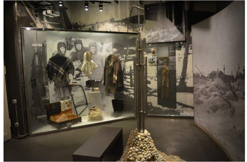
Museum of Occupations and Freedom Fights in Vilnius