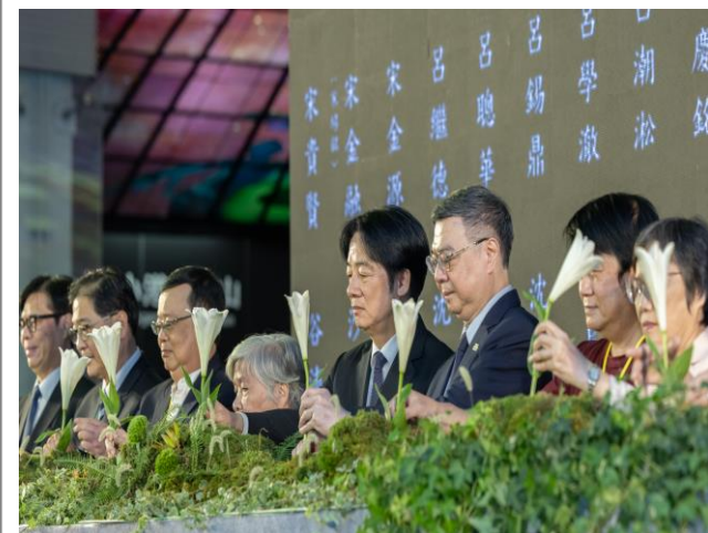
2025 Joint Ceremony for Redressing State Misconduct

Long-term care, psychological support, and community-based services to rebuild social connections and trust.