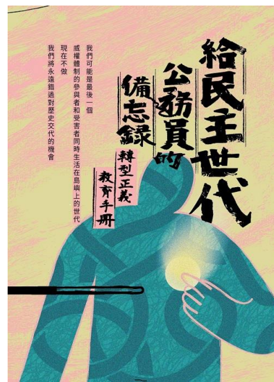
←Memo for Public Servants of the Democratic Generation: A Transitional Justice Education Handbook