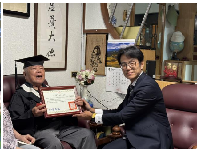
Political victim was presented with honorary graduation certificates by the Ministry of Education and University