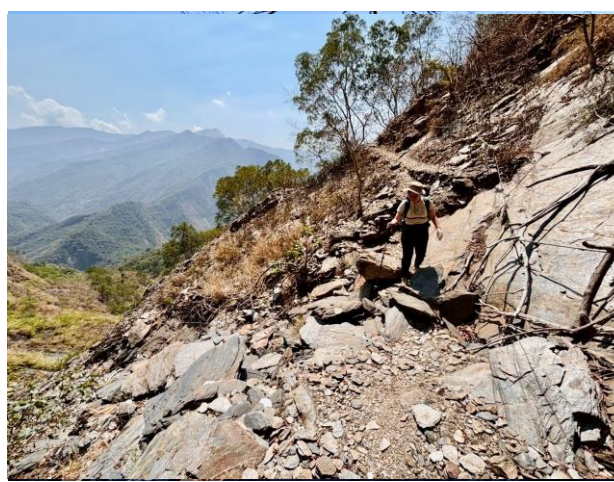
Staff members hiked six hours to a remote Indigenous village to deliver a certificate of rights restoration.