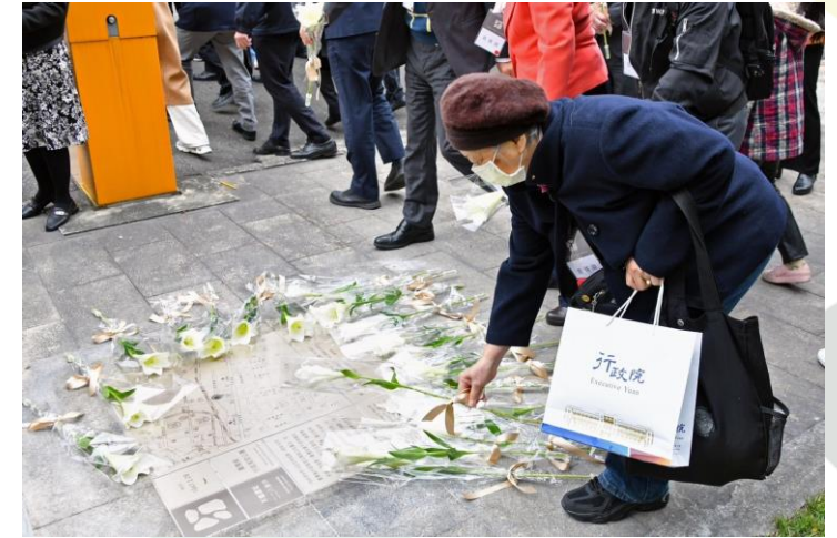
Exhibitions and Public Engagement Activities