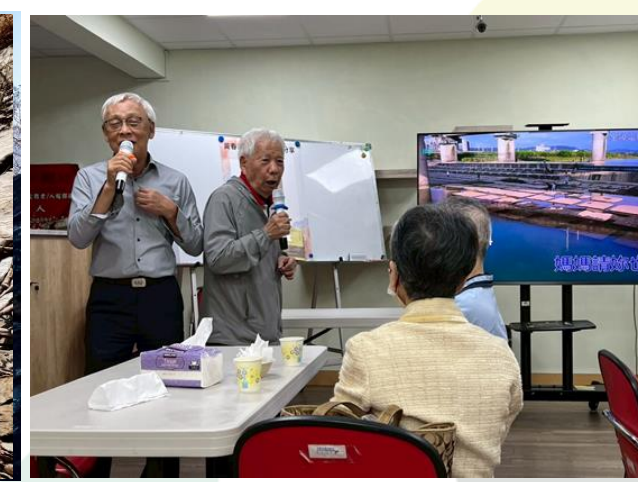
Support Service Centers for Political Victims and Their Families